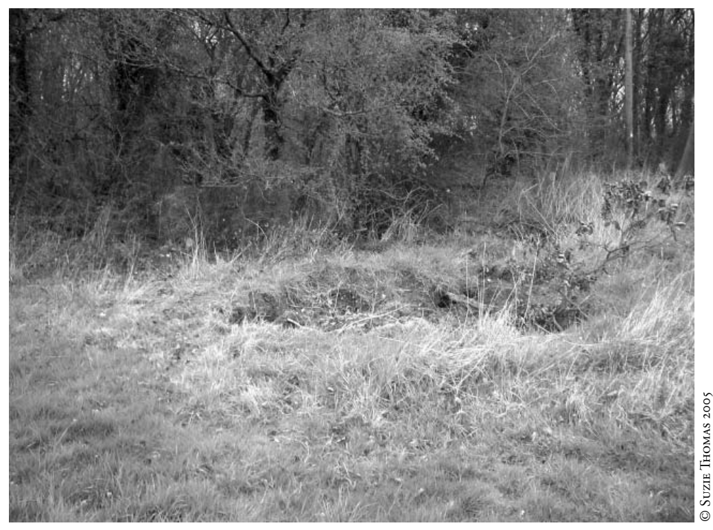
Fig 14.3: Recently disturbed soil at the Romano-British temple site at Wanborough, the foreground is on privately owned land, while behind the trees is Green Lane, owned by Surrey County Council.

detecting still occurs at such a rate as previously believed. Whether it does or not, one has to wonder whether another incident infamous (or famous?) on the scale of Wanborough will ever emerge.