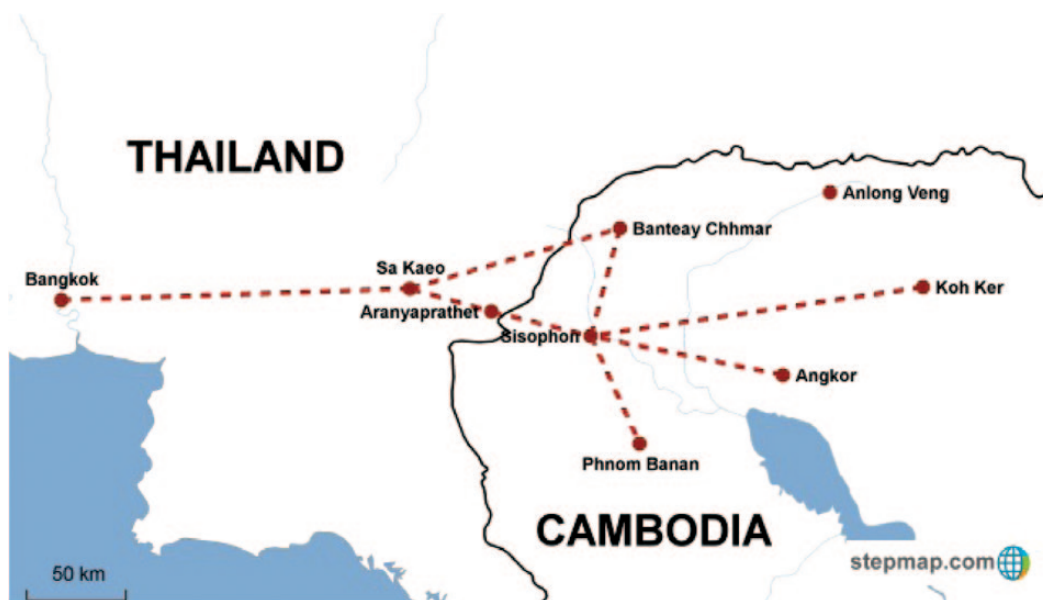
FIG. 2 Trafficking routes in the ‘Channel I’ network.