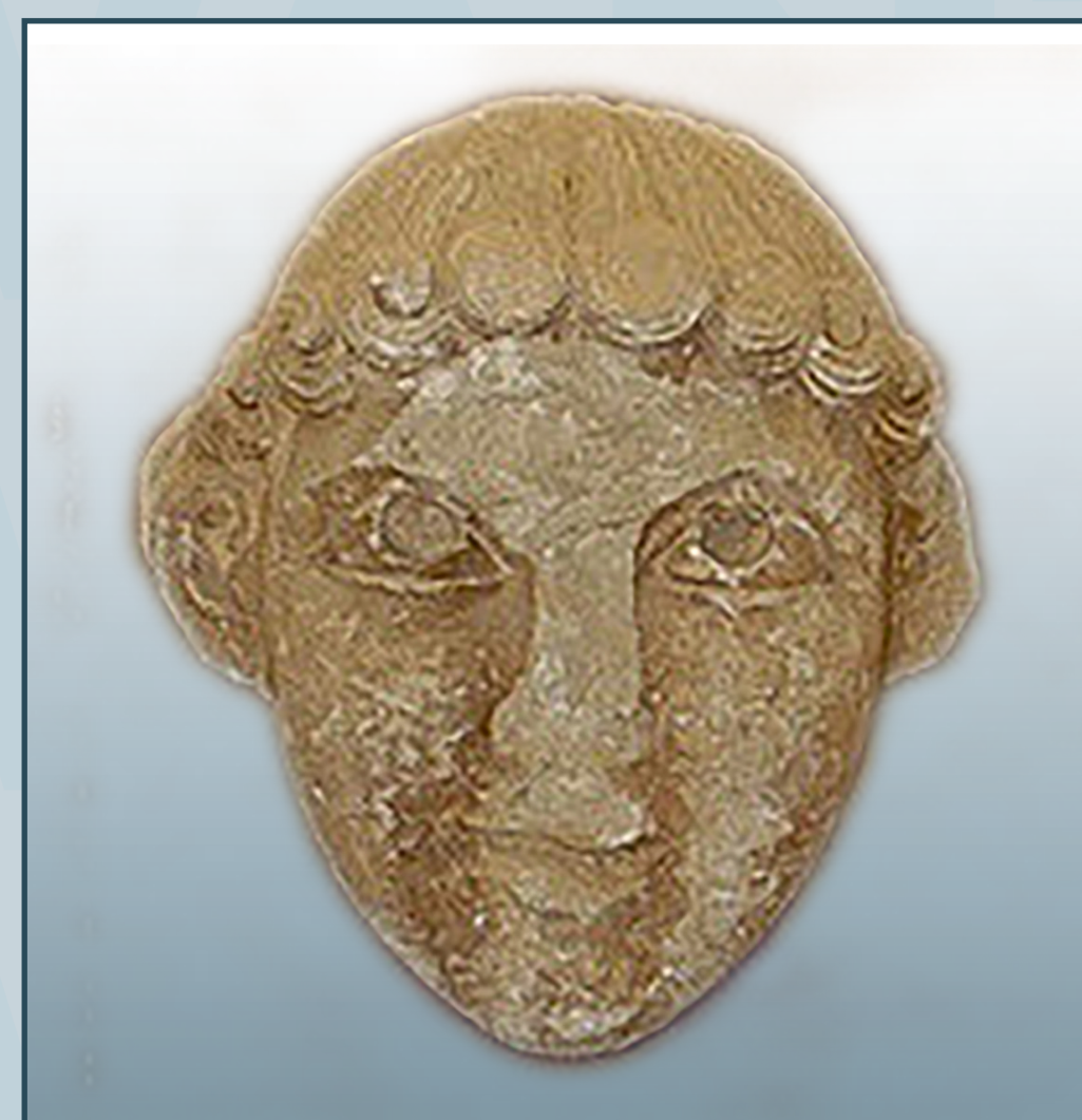
Limestone male face 70 x 50 cm