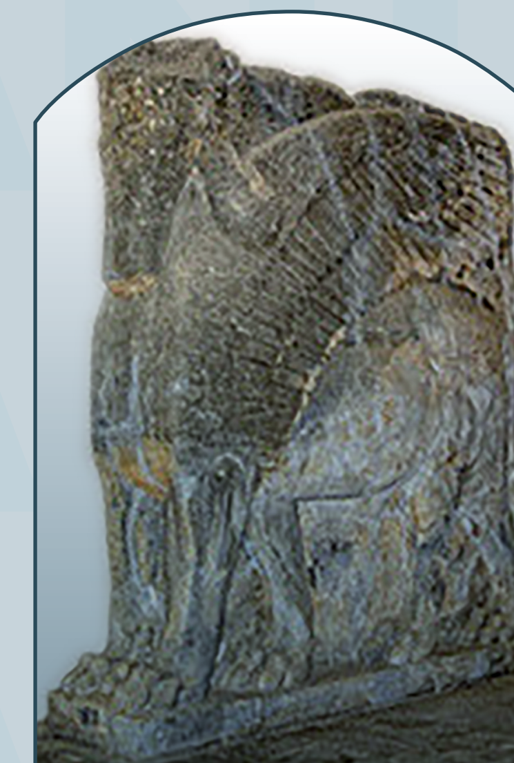
Pair of winged bulls Blue marble