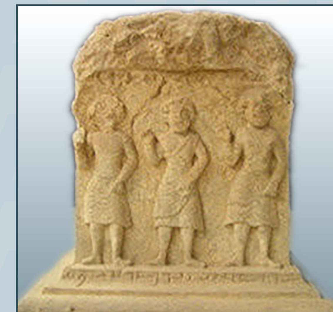
Marble bench With Aramaic writing

Authorized database users can view other objects stolen from the Mosul Museum, under folder reference 2016/17962