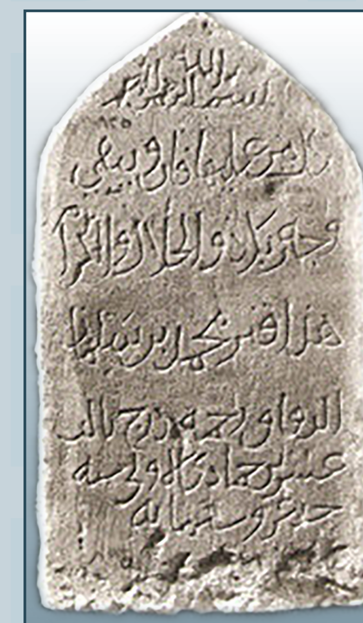
Marble tombstone 611 of Hegira 78 x 41 cm