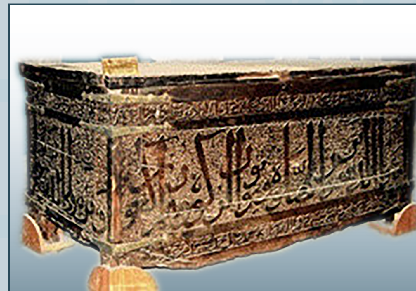
Teak chest 637 of Hegira With names of twelve imams and Koran verses