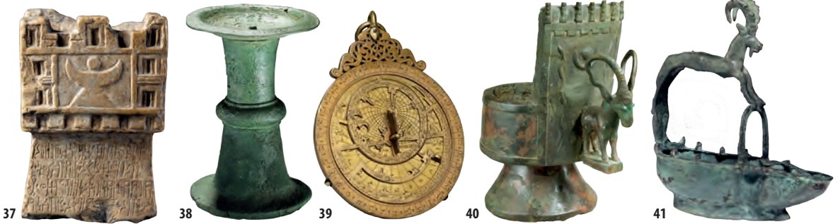
37. Limestone incense burner, South Arabia, late 3 rd c. AD, 25.5 x 18 x 16 cm.

Incense burners, astrolabes and lamps: Made of metal, stone or clay, of various shapes and forms.