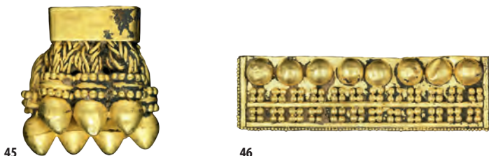
45. Gold pendant, Yemen (Marib ?), 1.42 x 1.31 cm.

Earrings, pendants, rings, bracelets, necklaces and anklets made of gold or silver; can be beaded.