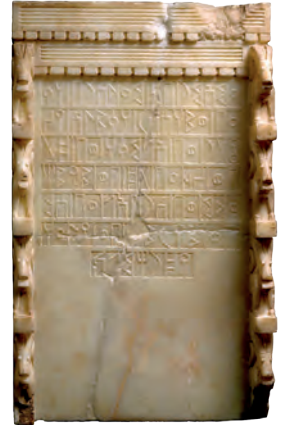
26. Limestone libation table, Yemen (Marib), 10 x 123.5 x 69 cm.