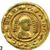
32. Gold coin, Yemen (North of Aden), ca. AD 450-500, Ø 0.17 cm.