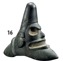
16. Humanoid stone trigonolith, Taíno culture (11 th - 15 th centuries), 18 x 20.5 cm.

Petroglyphs: Stalactites or rocks with geometrical, abstract or figurative (human beings, animals, objects) motifs. Sculpted, incised, using the stone's natural relief or outlined with a furrowed or dotted groove (may be coloured).