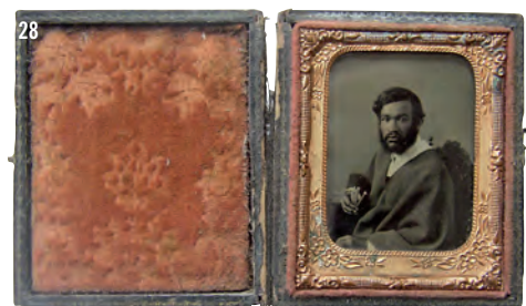
28. Ambrotype, anonymous, ca. 1870, 7.3 x 12.5 cm.