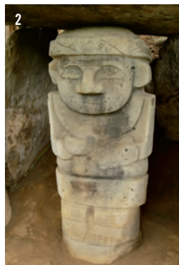
2. Monolithic statue, San Agustín, 1-900 AD, 106 x 70 cm.

© Instituto Colombiano de Antropología e Historia (ICANH)