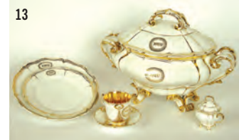
13. Bavarian porcelain, ca. 1850, soup tureen: 28 x 38 x 15 cm.

Pieces decorated with initials, captions and images of scenes or portraits; sculpted and coloured glassware. They include crockery, trays, ewers, washbowls, chamber pots, spittoons, pharmacy jars, centrepieces, lamps and vases. [illus. 13]