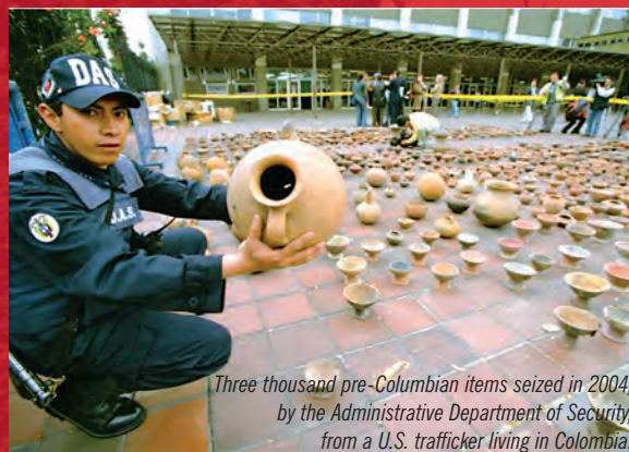
Three thousand pre-Columbian items seized in 2004, by the Administrative Department of Security, from a U.S. trafficker living in Colombia.

Av. Eldorado No. 75-25, Bogotá Tel: (57-1) 426 6228 E-mail: gipacdijin@hotmail.com