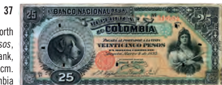
37. Banknote worth twenty-five pesos, National Bank, 1895, 7.6 x 18.2 cm.

c) Banknotes or State-issued notes , of different sizes, with allegorical engravings. [illus. 37]