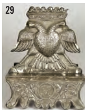
29. Silver lectern, New Granada Workshop, 18 th century, 35 x 31 x 30 cm.

For scientific, technological and industrial use. For example, medical, optical, and weighing and measuring instruments, barometers, plumb bobs, compasses, chronometers, astrolabes, octants, sextants, scales, telegraphs and telephones. [illus. 38-39]