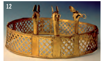
12. Gold diadem with bird figures, Muisca, 600-1600 AD, 15.7 x 23 cm.