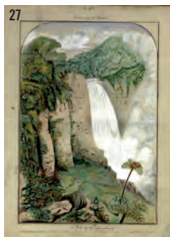
27. Watercolour on paper, by Manuel María Paz, 1855, 23 x 31 cm.