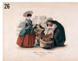
26. Lithograph in colour, by Ramón Torres Méndez, 1878, 27 x 35.5 cm.

b) Photography on metal and glass (daguerreotype and ambrotype). [illus. 28]