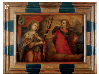
17. Oil on wood, anonymous, ca. 1700, 44.5 x 63.8 cm.