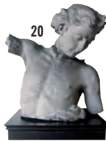
20. Plaster figure, by Dionisio Cortés, undated, 37 x 41 x 25 cm.