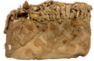
9. Cotton bag ( mochila), Guane, 1300-1600 AD, 30 x 20 cm.

Textiles with geometric designs. They mainly come from funerary offerings. [illus. 9]