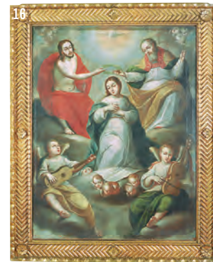
16. Oil on canvas, by Gregorio Vásquez de Arce y Ceballos, 1697, 156 x 118 cm.