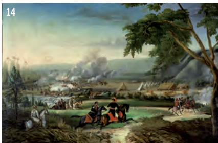
14. Oil on canvas, by José María Espinosa, ca. 1850, 81 x 121 cm.

b) Religious images of virgins, angels, saints and representations of Christ. [illus. 16-17]