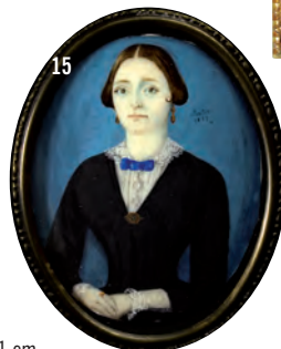
15. Watercolour on ivory, by José Gabriel Tatis Ahumada, 1857, 8 x 6 cm.