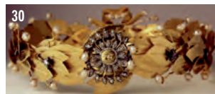
30. Gold civic wreath offered by the people of Cuzco to the Liberator Simón Bolívar, Chungapoma, ca. 1825, 7.5 x 22 cm.